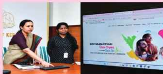
K-SOTTO Website Inauguration