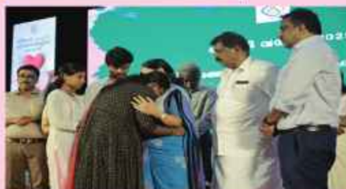
Donor Honouring Program